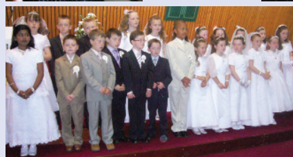
Group of First Holy Communion Boys and Girls from St Fiachra's Junior School