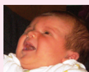
Bonny Baby Winner 2007