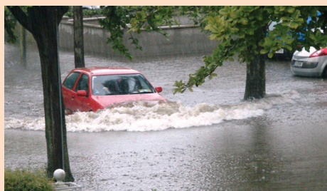
Car in Flood

The 9th of August started out as so many days this "Summer" showery and cloudy but all in all not too bad. At least it was a warm day. I had been driving down around Croke Park about 2pm that day and remember thinking how nice it is on match day to see so many families decked out in their county colours teeshirts heading to the match and how at least it did not look like it would be too wet that day. How wrong was !!!