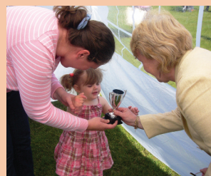
Marie Claire, Coolatree Park