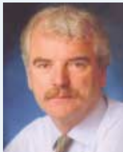
Finian McGrath T.D. (Ind)

Just keeping in touch with you on all local issues. At the moment I am working with the people of Beaumont on City Council issues, crime, care for the elderly, litter, environment, roads and drains and pushing for improvements at Beaumont hospital.