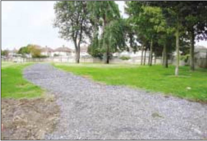
Coolgreena Close Park