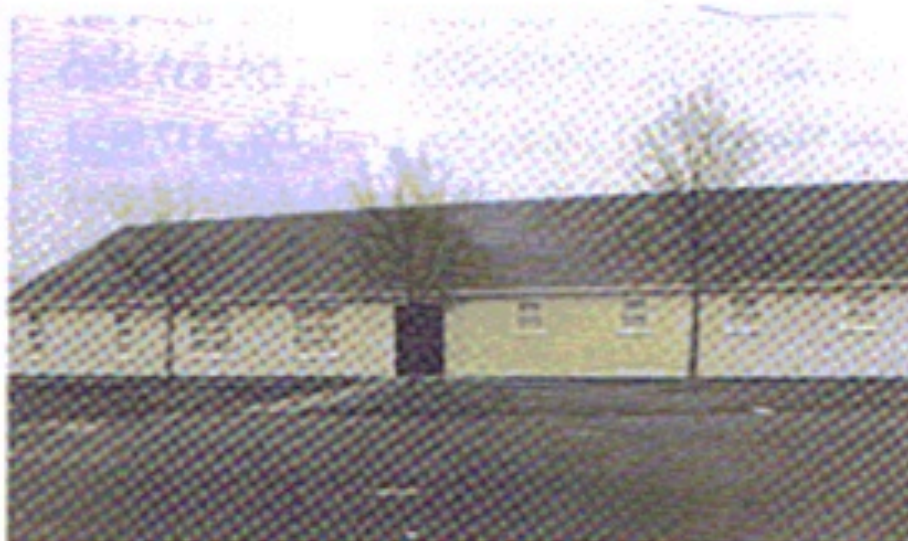
Front view of New Pastoral Centre.

The girls and boys from Second Class will receive their First Holy Communion on Saturday the 9 th of May and Saturday the 16 th of May. We hope they have a great day and a great sense of belonging to the community. The Lenten Talks, organised by the parish Millennium Group, have been a great success. There was a great variety of speakers and of topics and each night was different. You got the sense of a great deal of enthusiasm and interest from those who attended. Finally, just to take this opportunity to wish everyone a very happy Easter and every blessing at this special time.