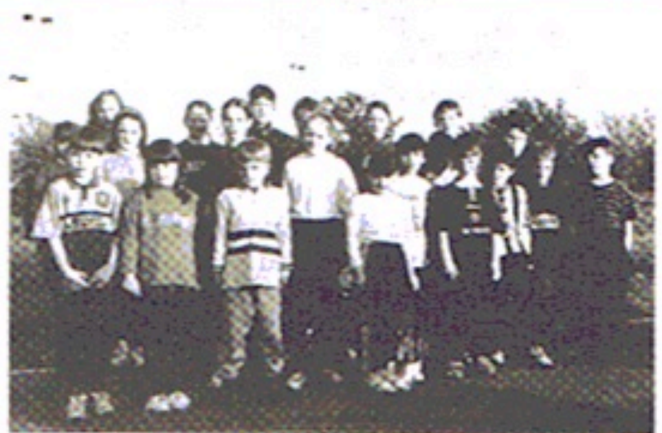
ALL RARING TO GO! The above group are all participants in the Athletics in this years Community Games. (FULL STORY pages 7 and 8)