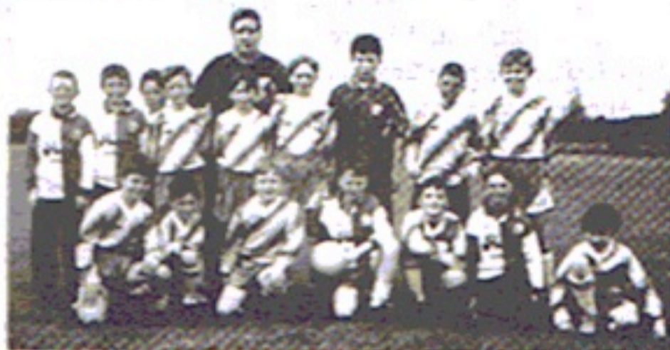
Pictured above - Our galant team who were narrowly beaten on penalties after extra time against Donabate on Sunday , May 10, in the Community Games.