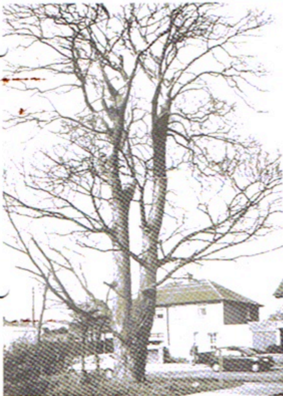
Tree on Beaumont Road, March 17th, 1998, St. Patricks Day