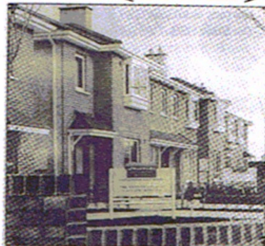
Only 25 houses of the second phase of the Beaumont Woods development in Dublin 9 remain unsold

The location for the development is not only attractive, but also very practical as it is within reach of the city centre, Beaumont Hospital, the M50 ring road, the airport, Eastpoint Business Park