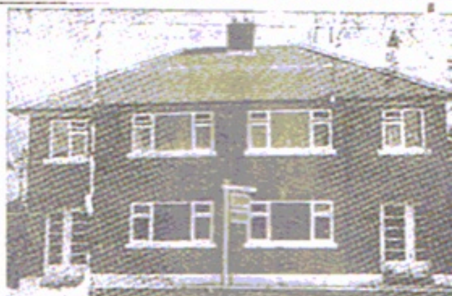
BELFIELD PARK ESTATE, DRUMCONDRA

Remember, we have not allowed the heavily increased costs of materials, wages and transport to alter the prices of these houses – which were fixed some years ago. With the added attraction of a free cooker – or its equivalent value – a home at Belfield Park is a home investment that is un-challenged for value in Ireland to-day.