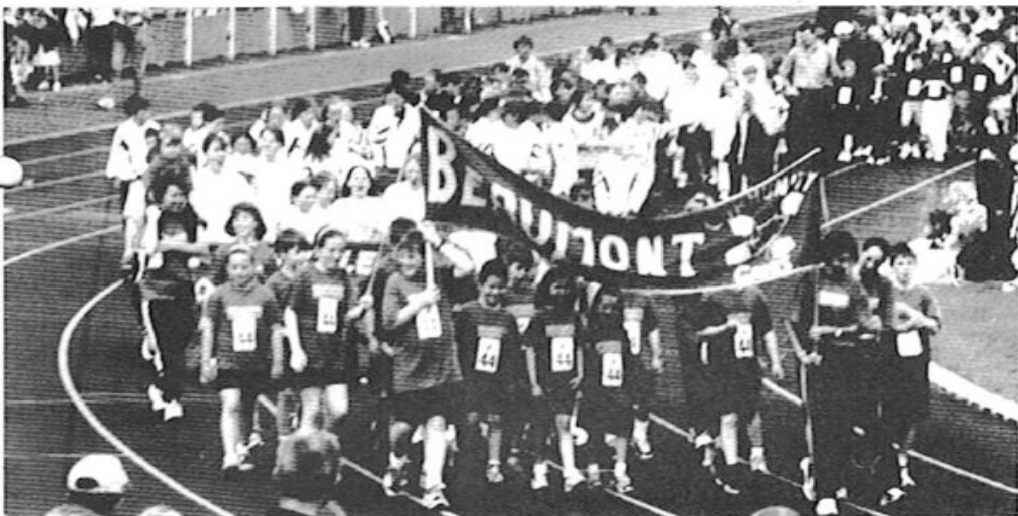
Pictured above are some of our representatives in the parade at Morton Stadium for the 1999 Community Games.