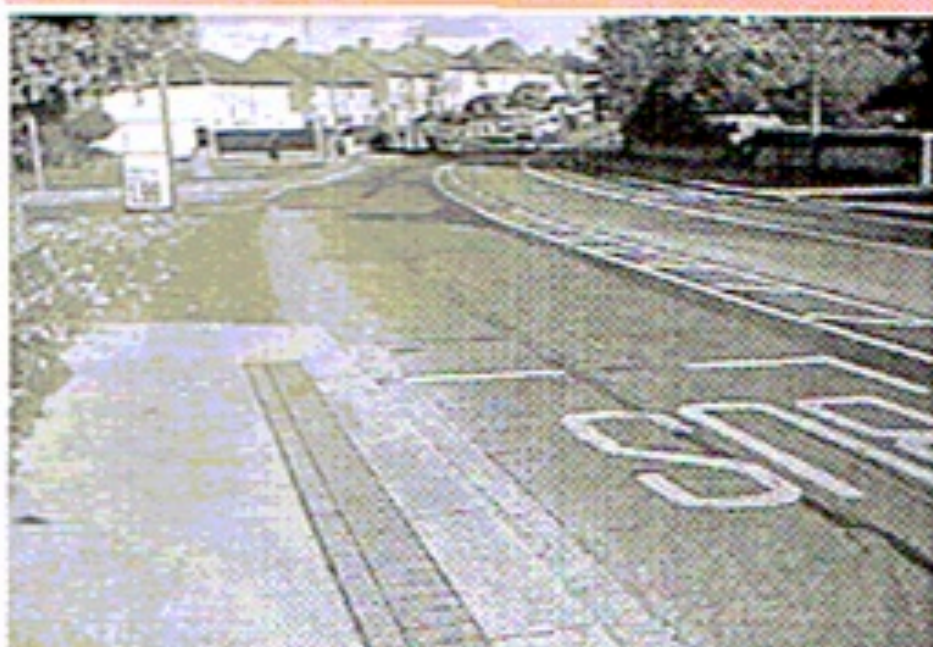
Three lanes on the Beaumont Road (including a QBC lane) the road is only suitable for two and will cause untold troubles.

Re: Quality Bus Corridor on Beaumont Road. 23rd November 2001 -- Ald. Sean Haughey, T.D.