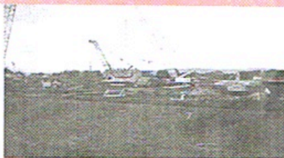
Port Tunnel work commences with massive traffic disruptions which will last for over two years. We're told when it is finished the improvements will be worth it!

Phase II will be undertaken in Spring 2002 when suitable weather permits. No decision has yet been made on the timing of Phase III.