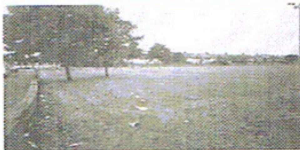
The park at Coolgreena Close after persons unknown had their lunch time snack. The litter wardens will fine the culprits £100 on the spot for offences like this.