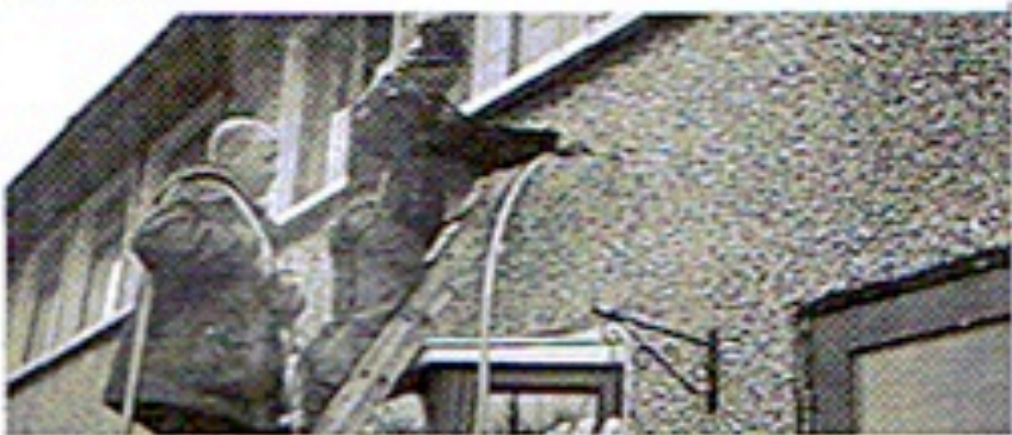
Picture shows the holes being filled with the foam.

The ureaformaldehyde foam method involves drilling holes above ground level in the walls and pumping in the foam at an extremely high pressure to push its way into all the blockwork in the house. Once inside it expands and then goes solid after time to insulate the core of the cavity block. The holes are filled in afterwards and are unnoticeable after a while. There is only one company in Ireland that does this form of insulation and that is Shannon Insulation (See Yellow Pages if you are interested.) You will probably get no change out of €1,000 for the average house in Beaumont.