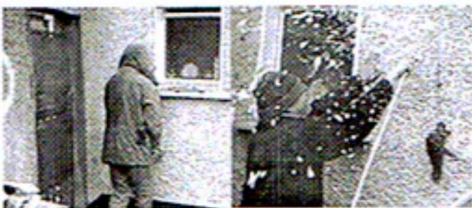
Holes are drilled into the walls and ureaformaldehyde pumped in under pressure.

Filling the space in cavity walls it is said will reduce heat loss by up to 30% - the cost it is said is recovered in 4-5 years. This is not a DIY job and must be done by professionals. If your house is suitable choose a firm which is registered with the appropriate body. There are several methods—mineral fibre threads expanded polystyrene beads and ureaformaldehyde foam. Solid walls call